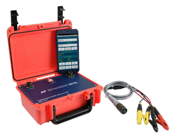
Figure 2 – Vibrating wire indicator

The EDI-54V vibrating wire indicator can store calibration coefficients from 10,000 vibrating wire sensors so that the value of the measured parameter from these sensors can be shown directly in proper engineering units. For